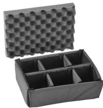
iM2100-DIV Padded Divider Set