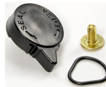
iM-VALVE-M-B Manual Purge Valve