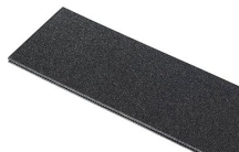
1500TPDIV Extra TrekPak Dividers