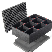
iM2100TPKIT TrekPak Case Divider Kit