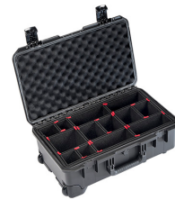
iM2500-X0006 With TrekPak Divider System