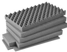
iM2500-FOAM 5 pc. Replacement Foam Set