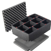
iM2500TPKIT TrekPak Case Divider Kit