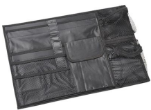
iM2500-UTILITYORG Utility Organizer