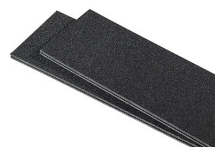
1555TPDIV Extra TrekPak Dividers