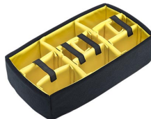
iM2500-DIV Padded Divider Set