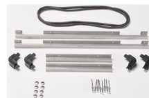
iM2500-BEZEL-LID Lid Bezel Kit