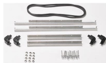
iM27XX-BEZEL-LID Lid Bezel Kit