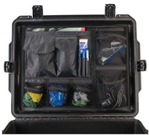
iM27XX-UTILITYORG Utility Organizer