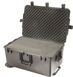
iM2975-X0001 With Foam