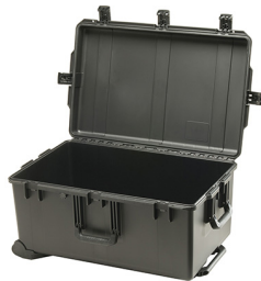
iM2975-X0000 No Foam