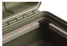
iM29XX-BEZEL Base Bezel Kit