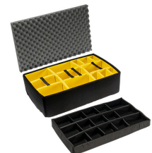
iM2975-DIV Padded Divider Set