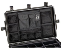
iM29XX-UTILITYORG Utility Organizer